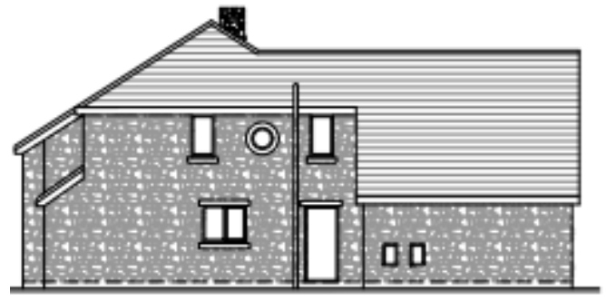
Existing Side Elevation (from 2 Tormore)