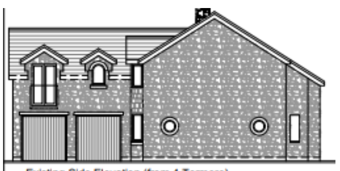
Existing Side Elevation (from 4 Tormore)